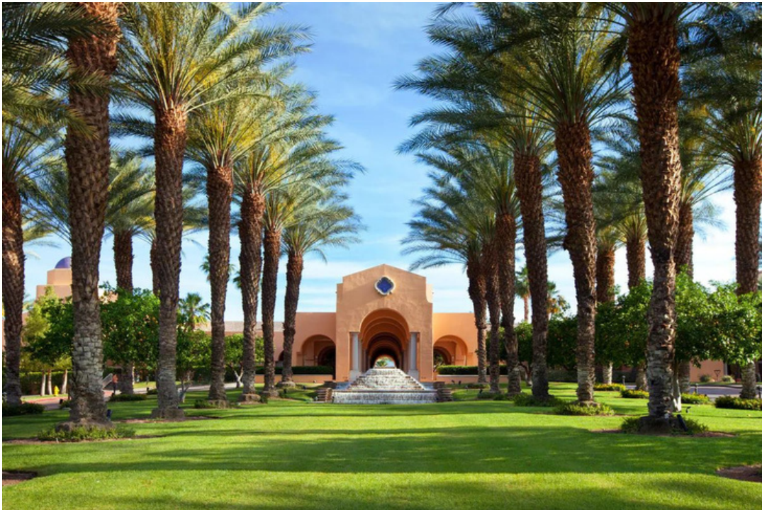
The Westin Rancho Mirage Golf Resort & Spa